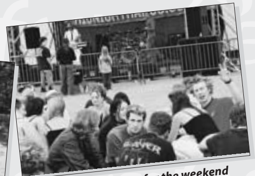
Rockfest - Something for the weekend