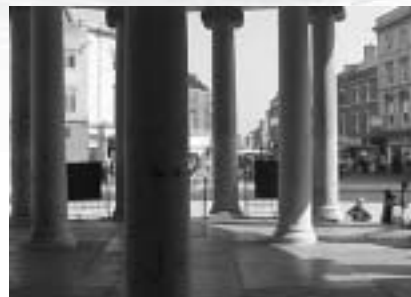
◀ An exciting enhancement for the Cornhill