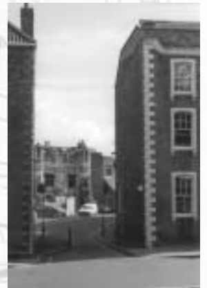
▲ Castle House 'possible restoration'?