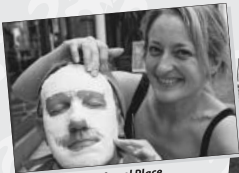
Face Casting in Angel Place