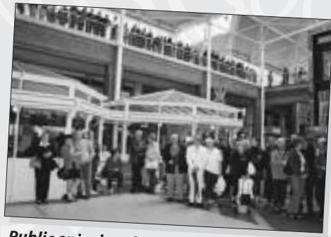
Public enjoying the opening events